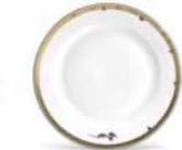
2153-0-00 ROUND DISH 315 MM