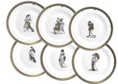
VARIATIONS ON 2521-0-00 DESSERT PLATE 210 MM