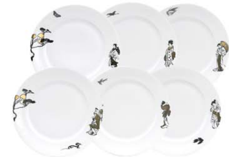
VARIATIONS ON 2524-0-00 MEAT PLATE 260 MM