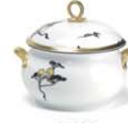
2022-0-13 SOUP TUREEN 4000 ML