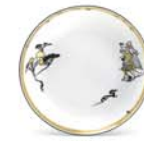
2148-0-00 VEGETABLE DISH 1900 ML