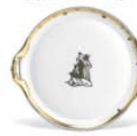
2315-0-00 CAKE PLATE 325 MM