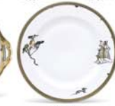
2152-0-00 ROUND DISH 335 MM