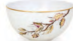
BOWL 02365-0-00 QUSA3 800 ML