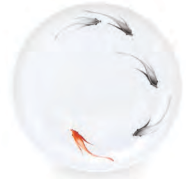
DESSERT PLATE 02538-0-00 EVE-PO 220 MM