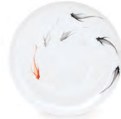
DINNER PLATE 02537-0-00 EVE-PO 270 MM