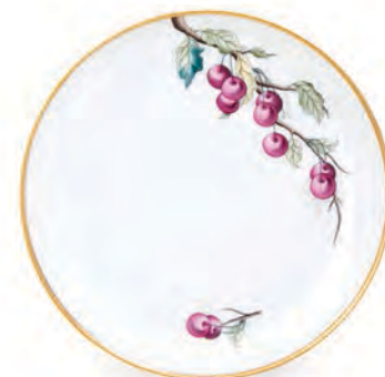
DESSERT PLATE 02538-0-00 QUSA2 220 MM