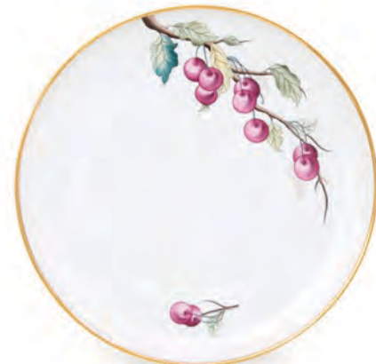
DINNER PLATE 02537-0-00 QUSA2 270 MM