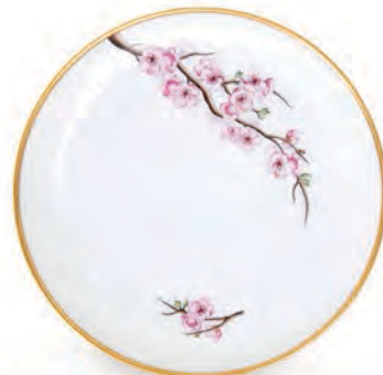
DESSERT PLATE 02538-0-00 QUSA1 220 MM