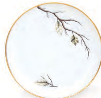
DESSERT PLATE 02538-0-00 QUSA4 220 MM