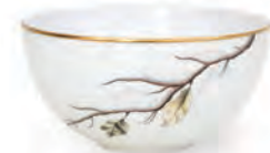
BOWL 02365-0-00 QUSA4 800 ML