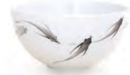
BOWL 02365-0-00 EVE-PO 800 ML