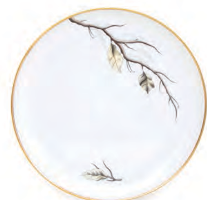
DINNER PLATE 02537-0-00 QUSA4 270 MM