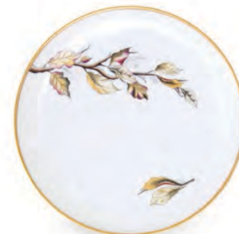
DESSERT PLATE 02538-0-00 QUSA3 220 MM