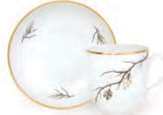
COFFECUP WITH SAUCER 02725-0-00 QUSA4 320 ML