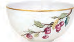
BOWL 02365-0-00 QUSA2 800 ML