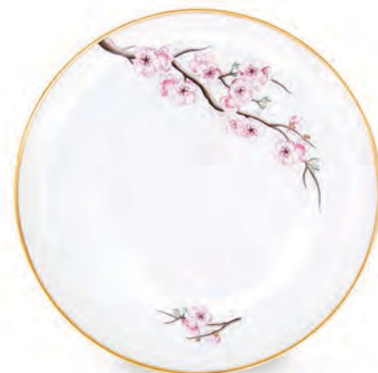
DINNER PLATE 02537-0-00 QUSA1 270 MM