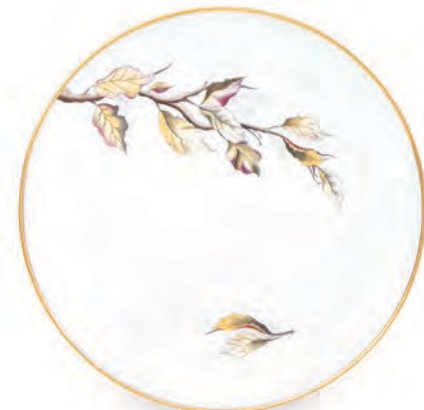
DINNER PLATE 02537-0-00 QUSA3 270 MM