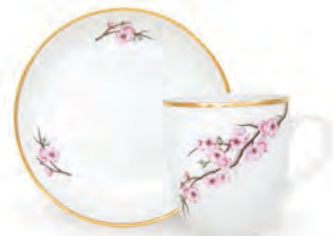
COFFECUP WITH SAUCER 02725-0-00 QUSA1 320 ML