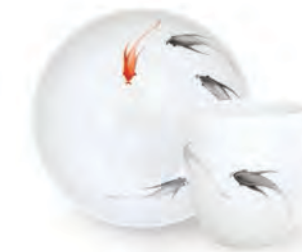
COFFEE CUP WITH SAUCER 02725-0-00 EVE-PO 320 ML