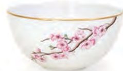
BOWL 02365-0-00 QUSA1 800 ML