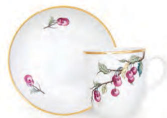
COFFECUP WITH SAUCER 02725-0-00 QUSA2 320 ML